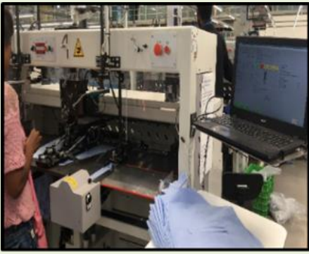
SLEEVE ATTACHING MACHINE