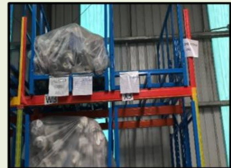
QUARANTINE / REJECTION