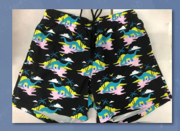
Fancy Pant & Short